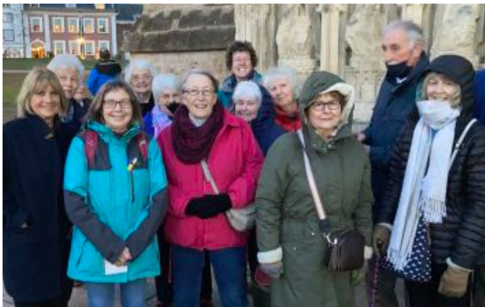
A GROUP of 18 from across the East Devon Five Alive Mission Community gathered at Exeter Cathedral on Thursday, March 10th to enjoy Aled Jones in concert. Although it was decidedly chilly in the cathedral, Aled chatted from the stage and warmed the hearts of the audience with classic songs from his latest album, Blessings