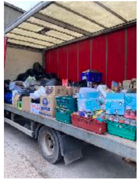
GOODS for refugees being loaded for onward transfer at SAK, above right; Prayer Vigil at Whitford Chapel and collection, above left