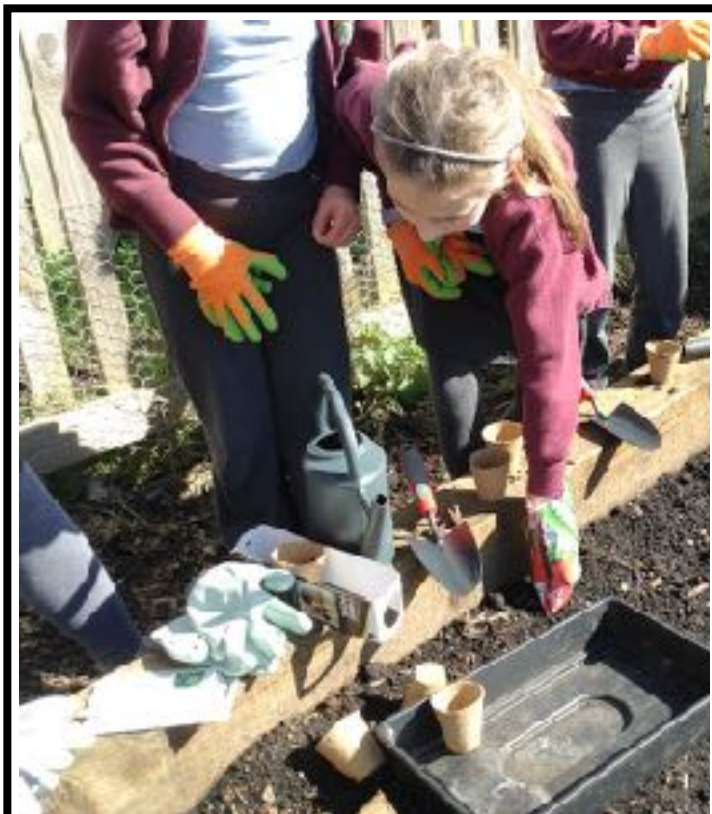
CHILDREN at Shute Community Primary School have been working hard weeding and tidying up the garden ready for spring planting