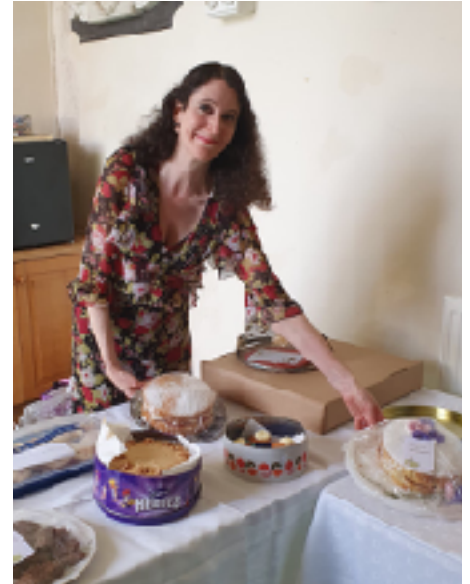
VOLUNTEERS welcomed National Trust Visitors to Shute Barton with a wealth of home-made local cakes

The parish is particularly grateful to the volunteers who helped with the refreshments and receiving the visitors to the church. The refreshments were organised in turn by the Friends of Shute Church and Shute Community Primary School