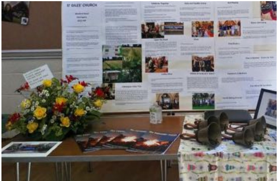
A TABLE displayed information on many village clubs, services and activities for new residents to browse

The East Devon Five Alive Mission Community was mentioned as was The Parishes' Paper , as well as Eco Church, litter pick, Celebrate Together Services, Open the Book, coffee shop, baby and toddler group, bell ringing, the choir, Frogs (Friends of St Giles's), the flower arrangers, the holy dusters, the church barrow, foodbank collections, the Parish Giving Scheme and the oil syndicate. The July services were of course also mentioned.