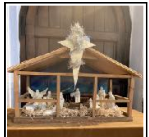
THE nativity scene from St Michael's Church, Stockland

FESTIVE wreaths and crafts were offered at the village market