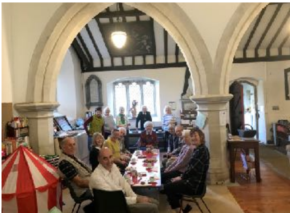
MUCH laughter and support enjoyed at the coffee shop events