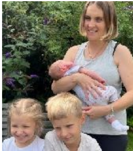
THIS family has been hosted by the Archdeacon of Plymouth under the Diocese Ukraine Support Scheme

"We are extremely grateful to everyone who has put themselves