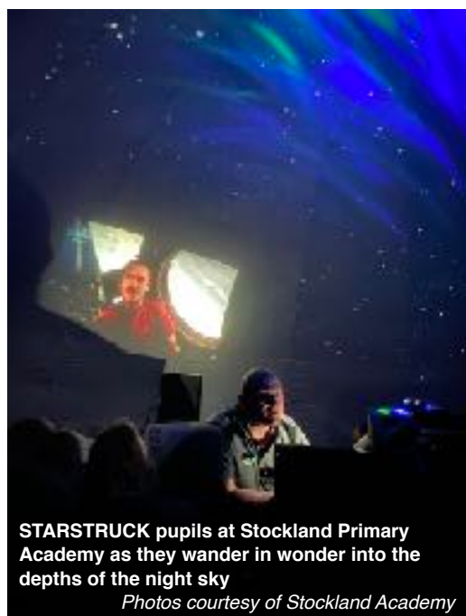
STARSTRUCK pupils at Stockland Primary Academy as they wander in wonder into the depths of the night sky

Stockland Primary Academy is clearly delivering curricula for tomorrow's population — one which is wide open to scrutiny and indeed envy and awe.