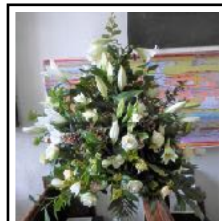
EASTER lilies which people of the village funded in memory of loved ones