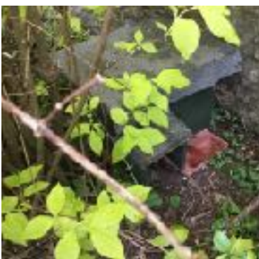
THE two hedgehog boxes are open and ready for guests

This helps us in our quest to strive for a bronze Eco Church Award.