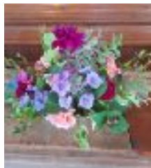
SOME of the stunning flower arrangements created by a special group of ladies and, left, the lunch being served