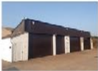
AXMINSTER DEVON EX13 5XD